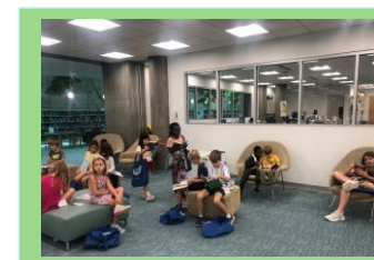
Above: Palmetto Students read at Richland Library.

We are happy to accept donations for the Mile via Venmo. Enter "Mile Pledge" in the Venmo note field.